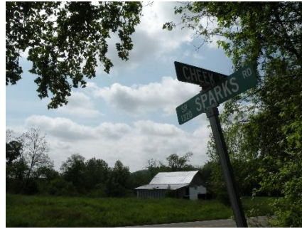
North Little Hunting Creek, Yadkin Co., N.C. (Surry Co. before 1850) [22]