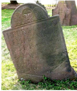
Figure 1. Phebe 3 (Parrot) Potter gravestone, New Providence.