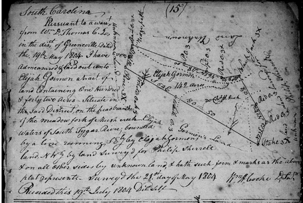
Figure 2. Elijah 1 Gorman land survey, Greenville Co., S.C., 1804