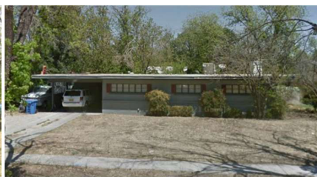
1005 N. Thomas, Carlsbad – address in 1954.