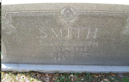
Gravestones from Findagrave.