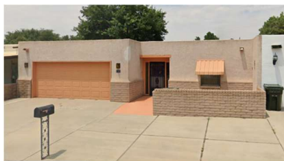
What I think is their final house at 1509 Live Oak Place at the Riverside Country Club in Carlsbad.