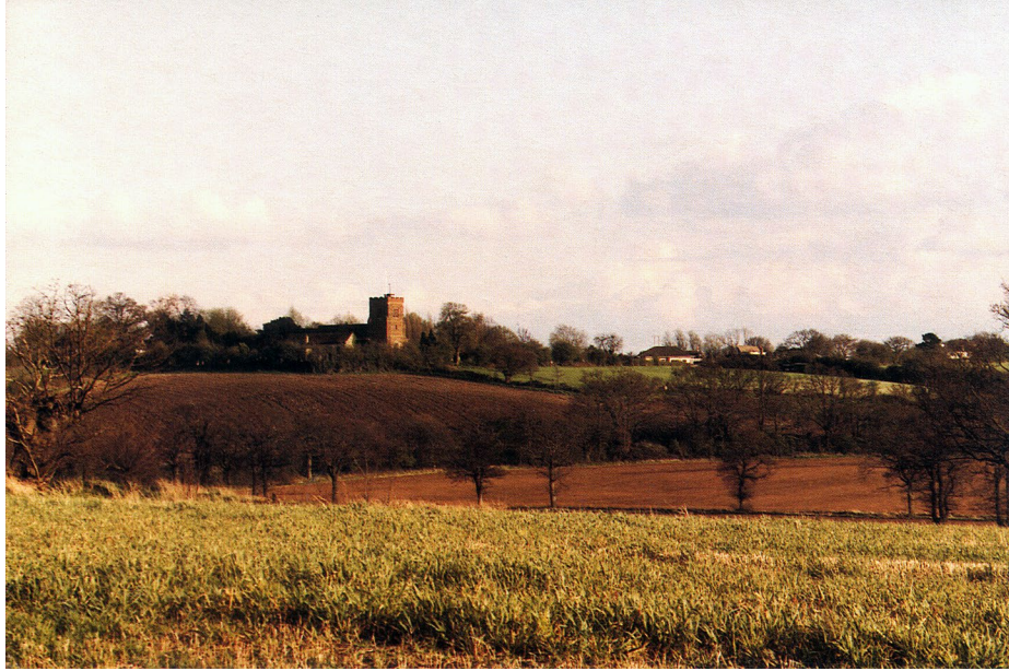
Figure 1. Nazeing Parish Church, Essex, England