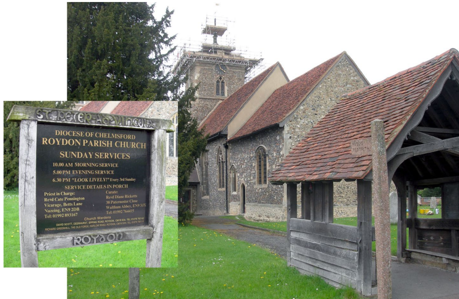
Figure 2. Roydon Parish Church, Essex, England