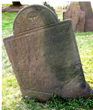
Figure 1. Phebe 3 (Parrot) Potter gravestone, New Providence.