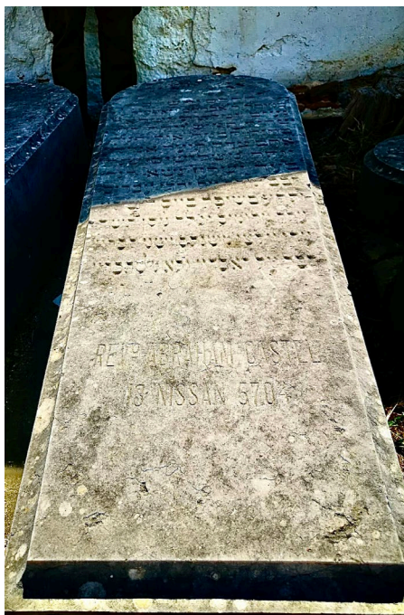
Figure 33. Rabbi Avraham Castel, Lisbon, gravestone