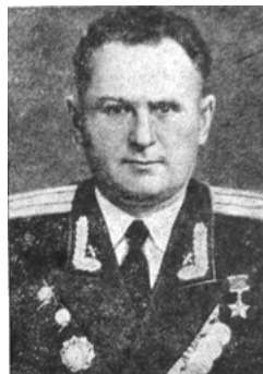
Figure 18. Gen. Khaskel (Vladimir) Moiseevich 2 Gopnik. Gold Medal, for Hero of the Soviet Union.