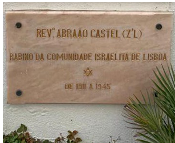
Figure 32. Plaque: Rabbi Avraham [Abrahão] Castel, Lisbon, 1911–1945