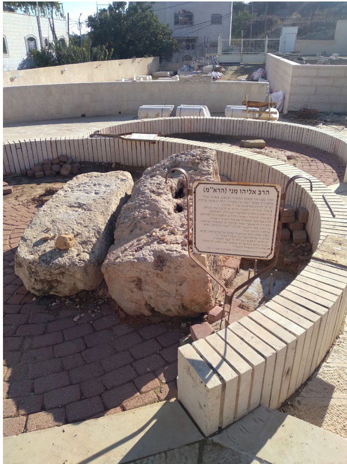
Figure 29. Hebron grave of Samara and Rabbi Eliyahu Mani