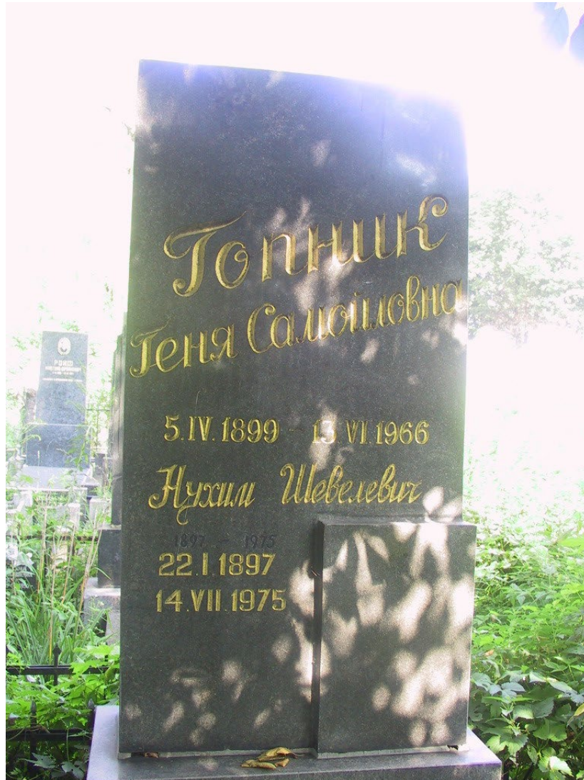
Figure 16. Gravestone of Genya Samoilovna and Nukhim Shevelevich Gopnik, Bucovina. They are probably Evgeniya Samoilovna and Naum Saulovich Gopnik.