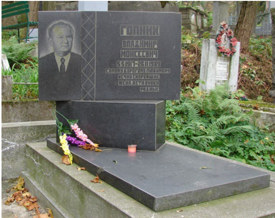
Figure 17. Grave of Vladimir Moiseevich 2 Gopnik, Hero of the Soviet Union, Lychakovskom Cemetery, L'viv, Ukraine